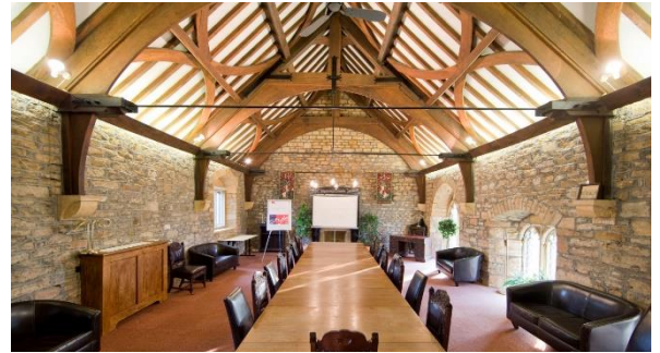
The Plucknett Suite

Other room layouts available; please enquire.