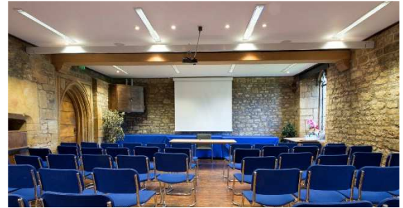
Theatre Style Layout