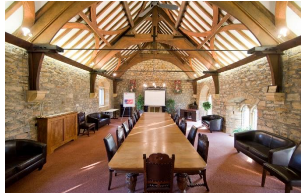
The Plucknett Suite