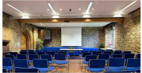
Theatre Style Layout